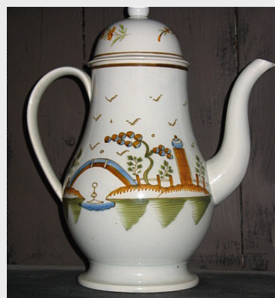
The whole pot

that this design was made by the Wood and Caldwell pottery in the late 18th and early 19th century. The couple had dug up some shards of this pattern on their property in the Lancaster, PA area, and had been looking for a whole piece ever since.